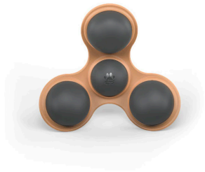
3D Flex Tip