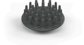
Soft Brush Tip