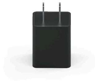
Charger & Cable